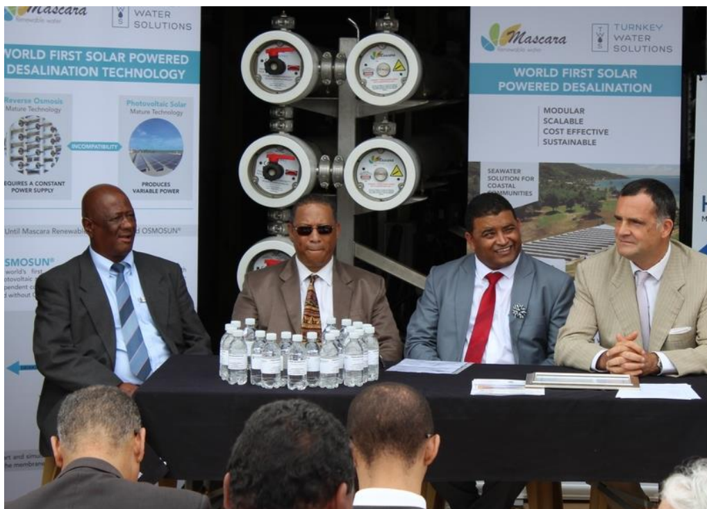
WITSAND ONTSOUTINGSAAANLEG OPENING